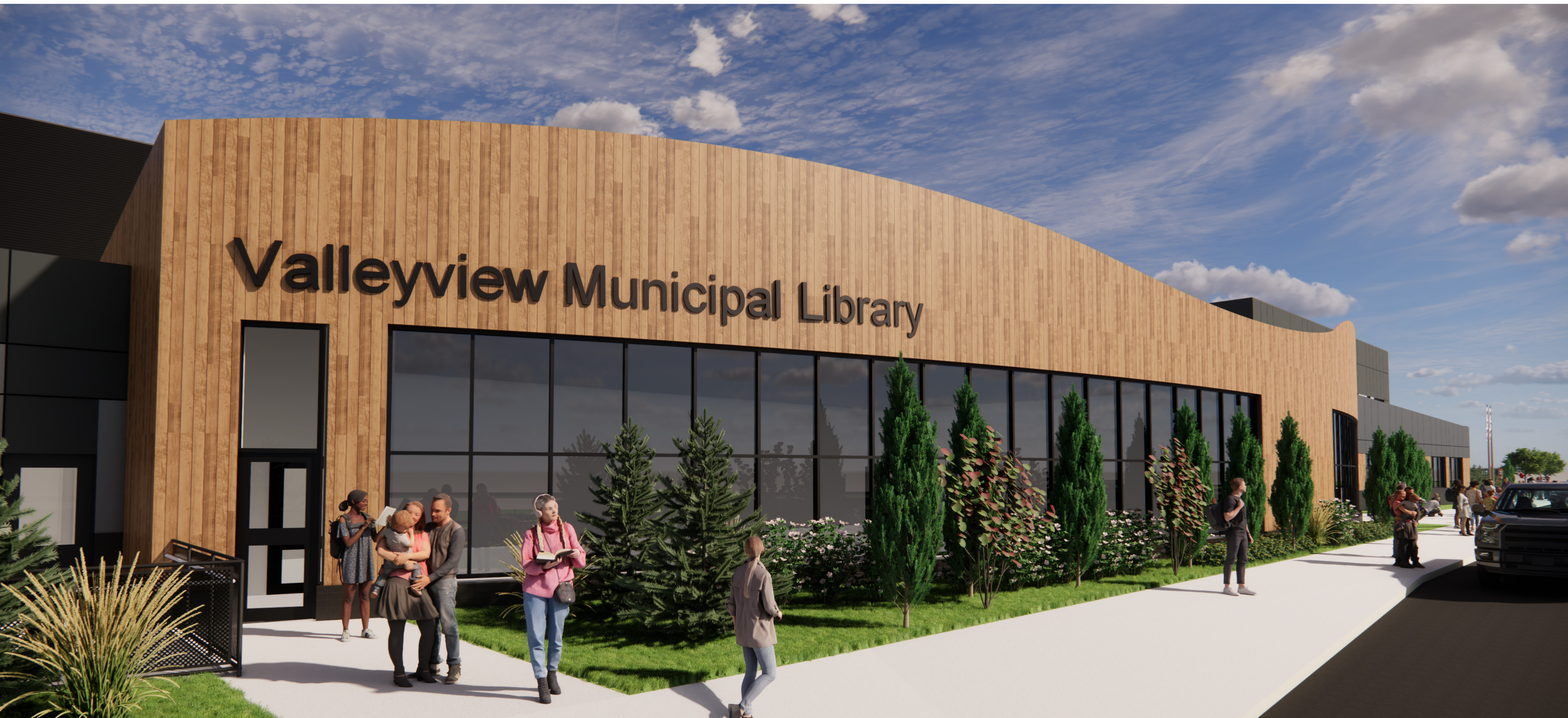
SOUTH PERSPECTIVE - VALLEYVIEW MUNICIPAL LIBRARY ENTRANCE VALLEYVIEW K-12 REPLACEMENT SCHOOL CONCEPT