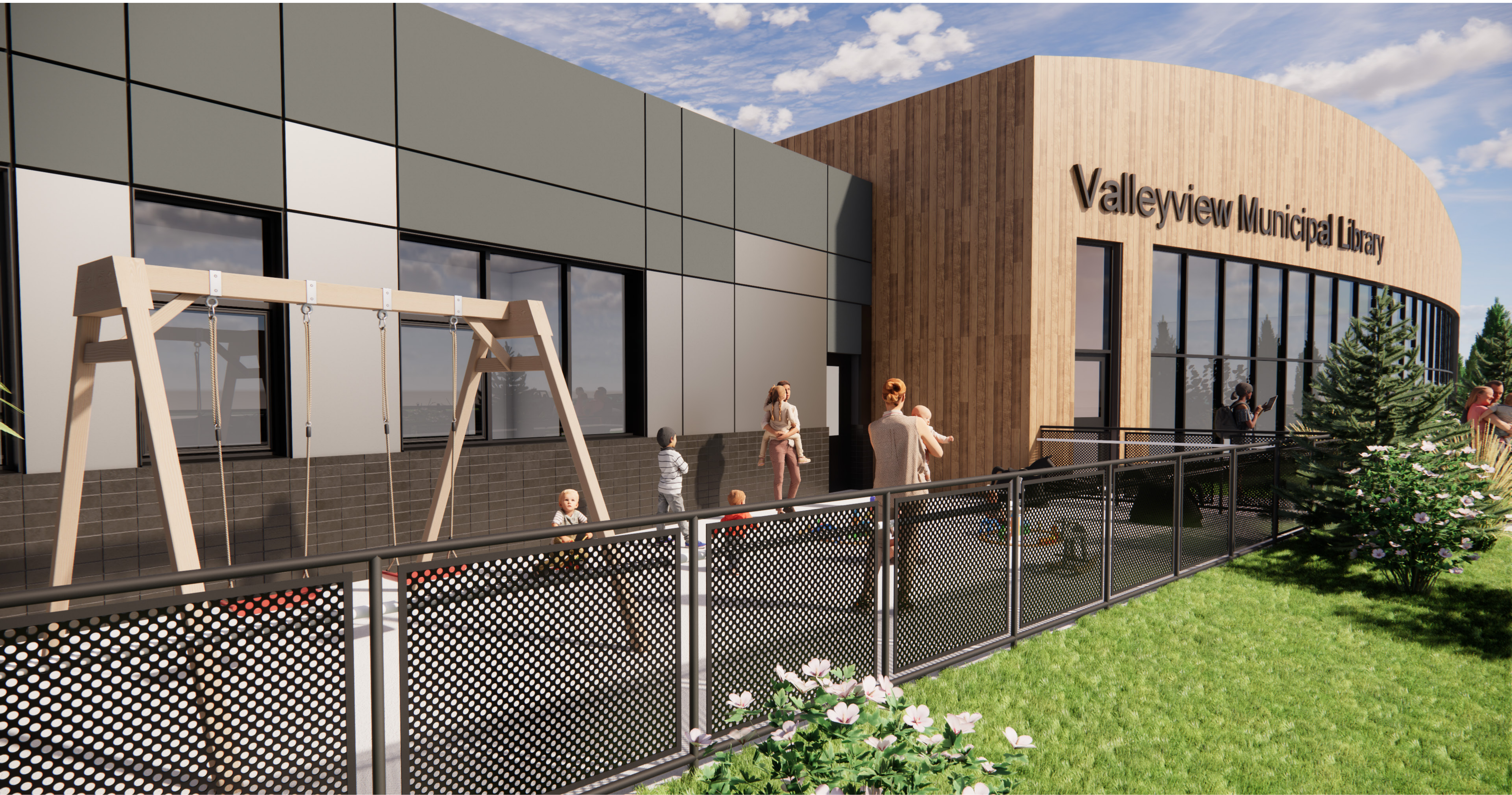
SOUTH PERSPECTIVE - DAYCARE OUTDOOR PLAY SPACE VALLEYVIEW K-12 REPLACEMENT SCHOOL CONCEPT