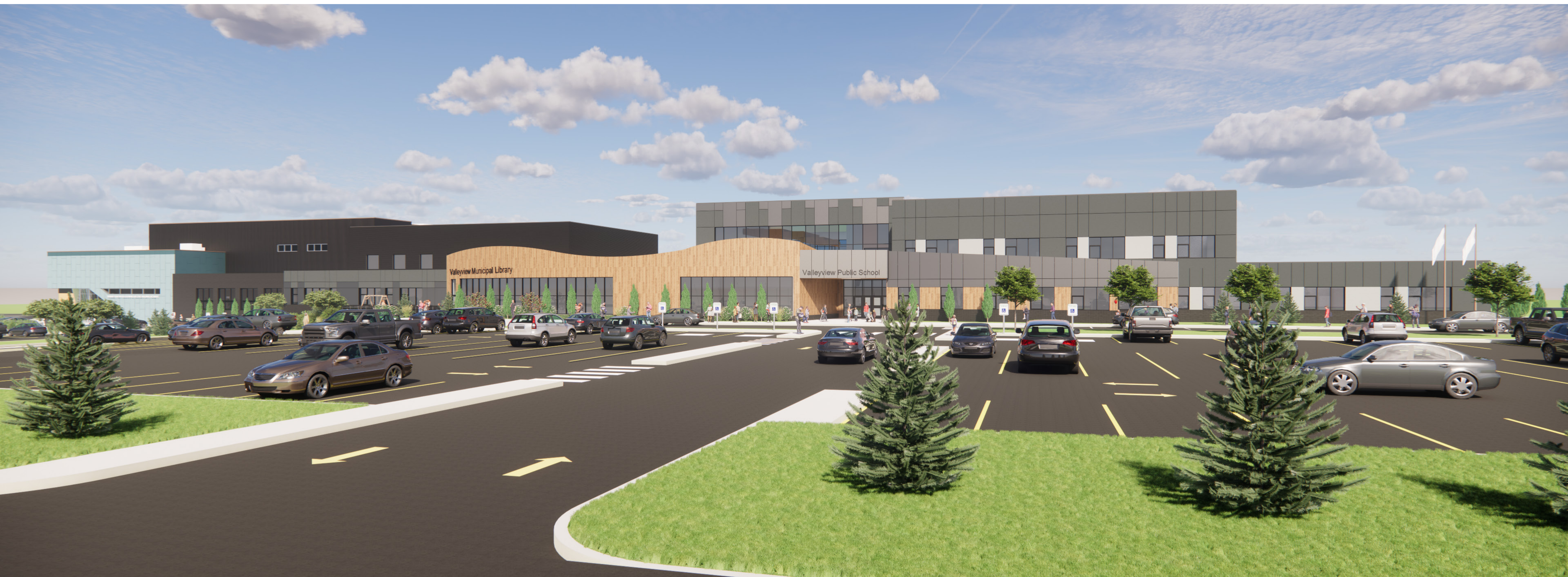
SOUTH PERSPECTIVE - OVERALL CONCEPT BUILDING WITH MULTIPLEX CONNECTION VALLEYVIEW K-12 REPLACEMENT SCHOOL CONCEPT