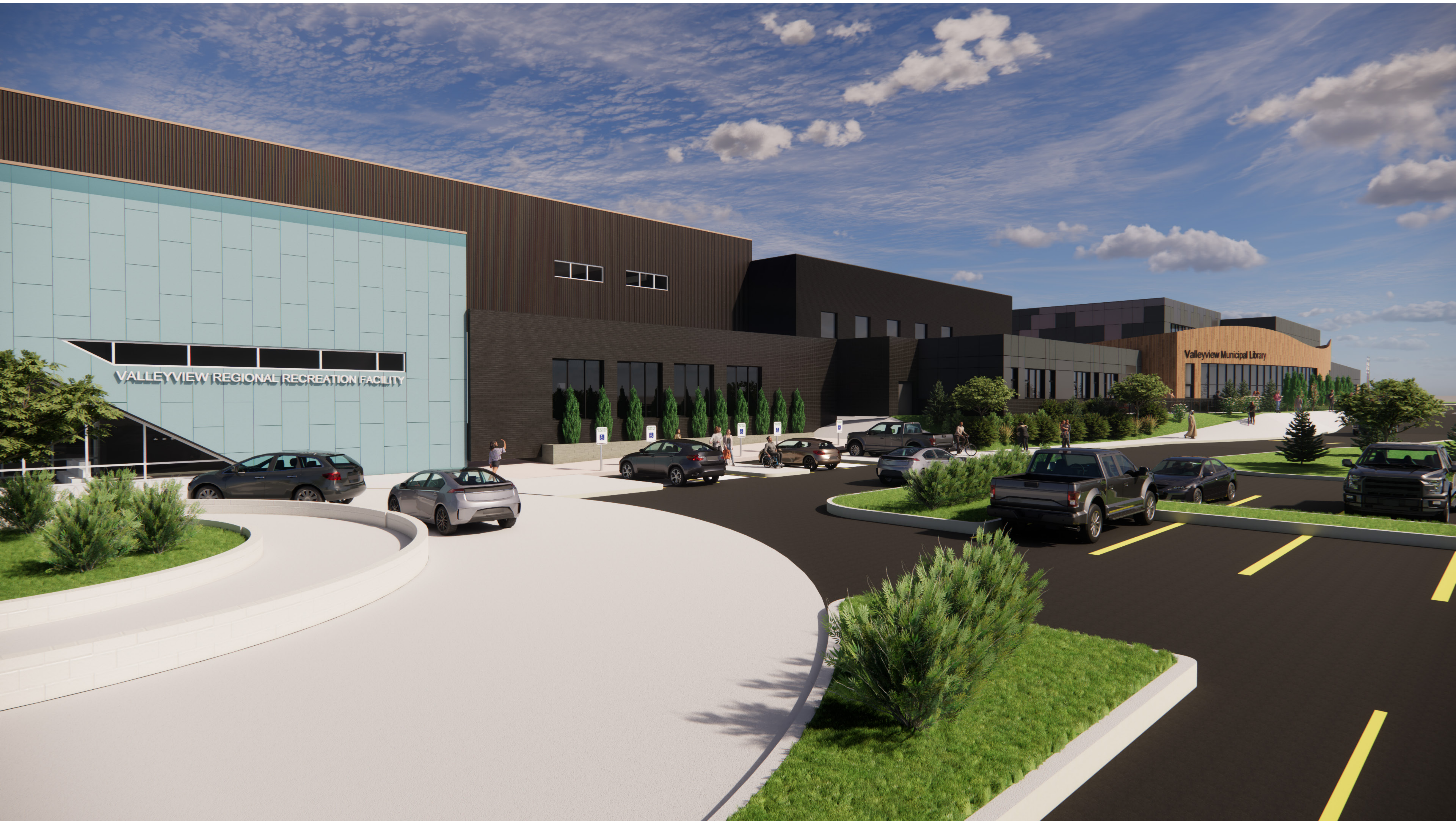
SOUTH PERSPECTIVE - MULTIPLEX CONNECTION VALLEYVIEW K-12 REPLACEMENT SCHOOL CONCEPT