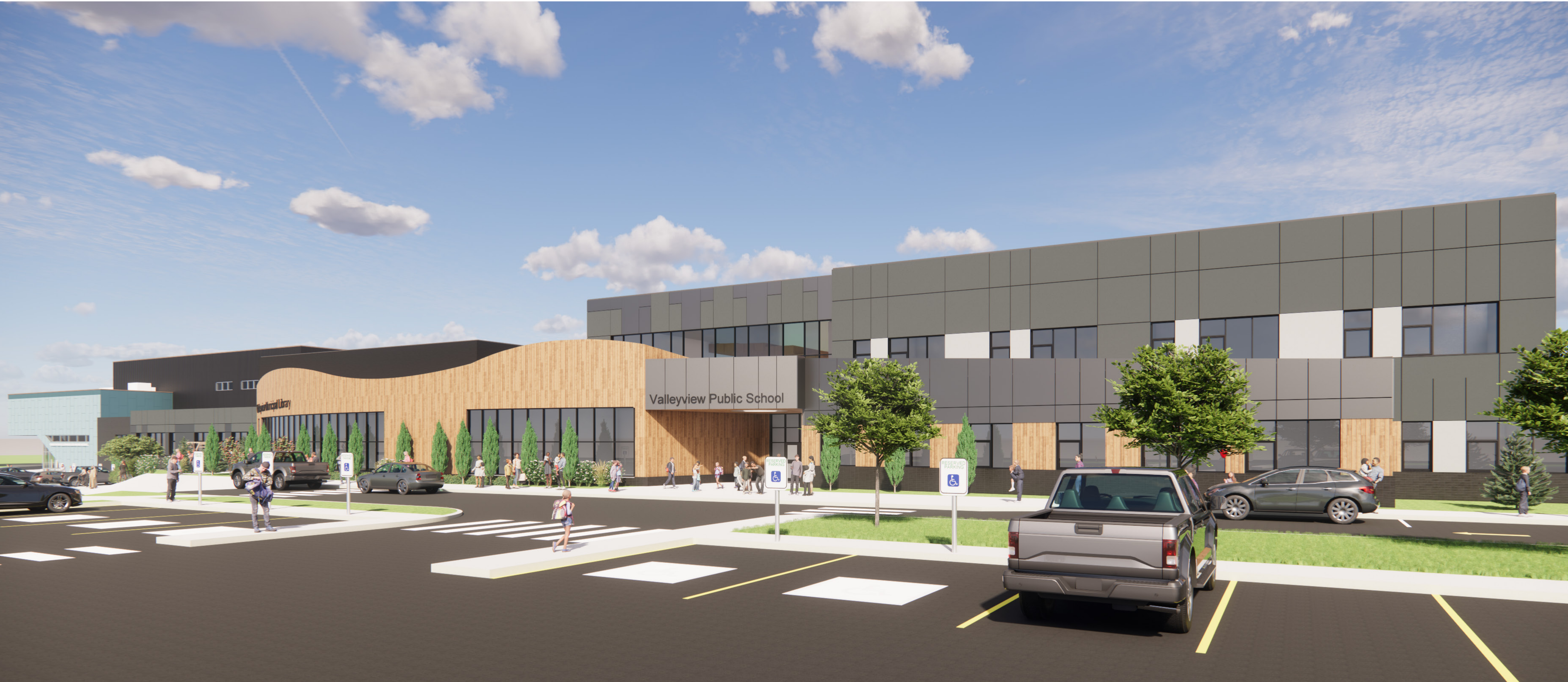
SOUTH PERSPECTIVE - MAIN ENTRANCE AND MULTIPLEX CONNECTION VALLEYVIEW K-12 REPLACEMENT SCHOOL CONCEPT