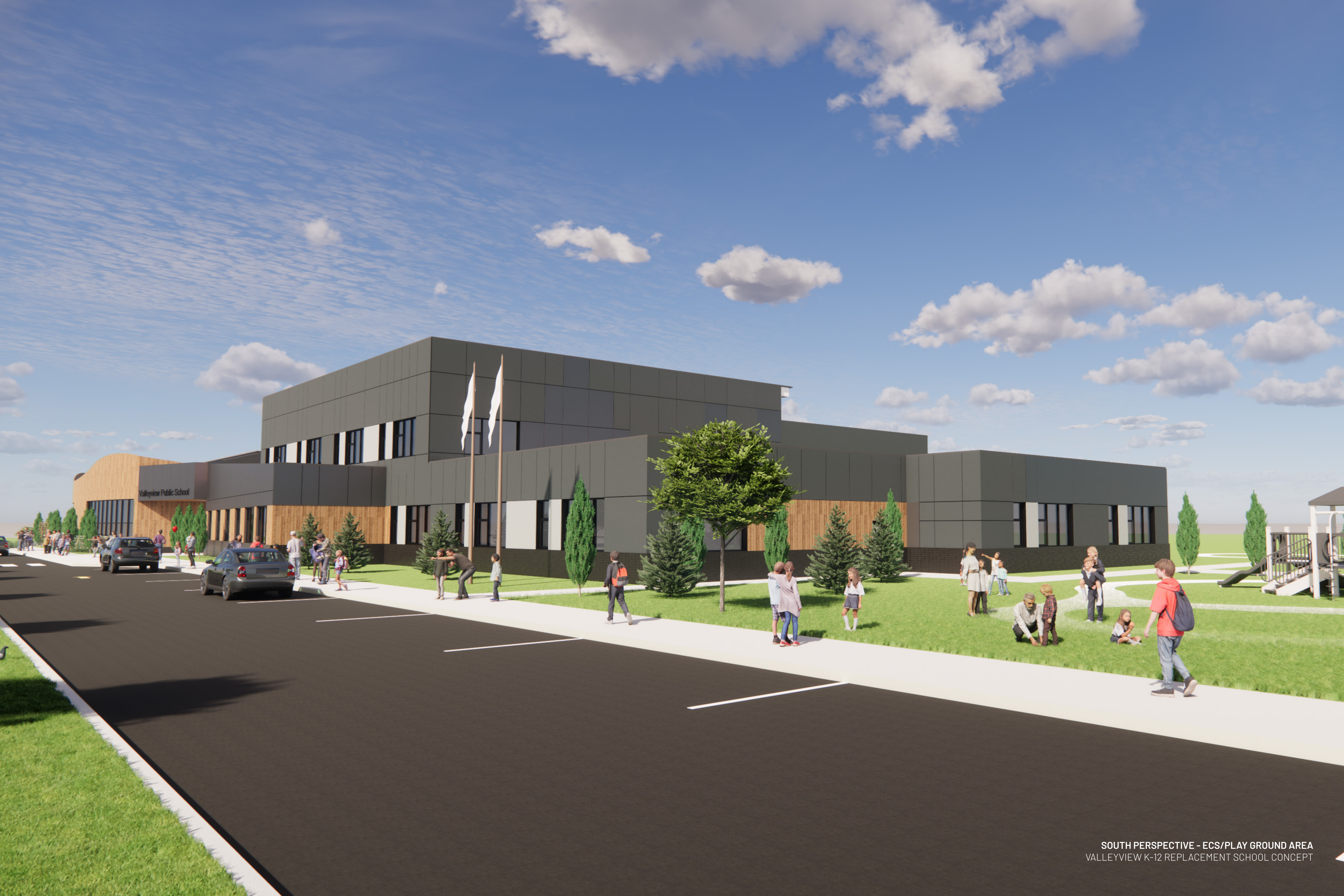
SOUTH PERSPECTIVE - ECS/PLAY GROUND AREA VALLEYVIEW K-12 REPLACEMENT SCHOOL CONCEPT